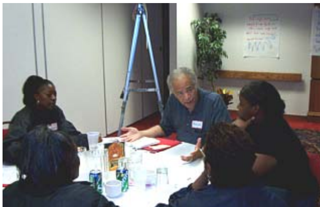
Prevention Partnership consultants helping members of the Triedstone Full Gospel Baptist Church in Chicago, IL to develop a comprehensive prevention action plan for their South Side community. (September 3, 2002)

It is for these reasons that the Prevention Partnership will sponsor its first Faith-Based Conference on HIV/AIDS and Substance Abuse Prevention. The Prevention Partnership has provided substance abuse prevention programming to communities since 1987 and in 1992 began offering HIV/AIDS prevention programs. It has received grant awards from the Center for Substance Abuse Prevention to develop and implement programs integrating HIV/AIDS and substance abuse prevention programming. Since 1996, its efforts have included training faith leaders and lay people in developing and implementing HIV/AIDS and substance abuse action plans in Black churches in Chicago.